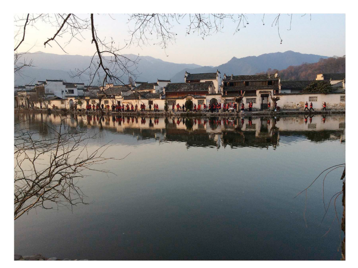
Fig. 2. A view of Hongcun.