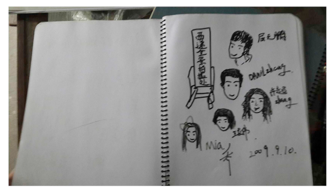
Fig. 3. Message board in Xidi's local hostel.

HC028: I think the most important thing for world cultural heritage is how to develop sustainable use of the site, rather than [relying on] old-style experts concerned about maintaining the physical objects. In my opinion, world cultural heritage is not a patient that needs to be taken care of by governments; rather it is a cultural product. This