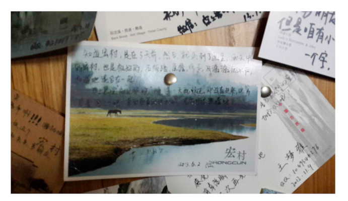
Fig. 4. Message board in Hongcun's local hostel.

cultural product produces economic effects, which locals, local governments and tourism companies can benefit from. Culture is the soul of heritage. [...] No matter how much the company invests, it is just like your clothes, very superficial. In terms of Hongcun, I think ... of course, it is important to protect our existing architecture which represents the milestones and the carriers of our culture. However, the protection is not simply for physical building or decorations that we can see. Intangible culture and customs also need to be considered. I am worrying that we are using the culture which was created by our ancestors for living. However, we are not developing our own culture. Fifty years later, there are just so-called 'old buildings' in Xidi without souls. (HC028, male, 54–65, local scholar)